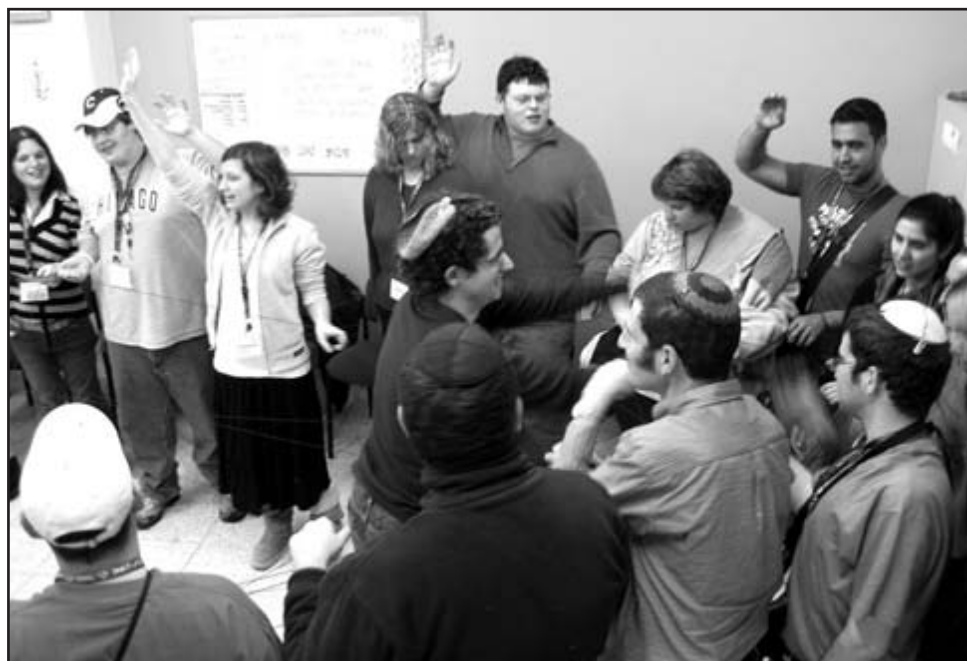
Staff and participants on a Birthright Israel trip for people with Asperger's syndrome socializing at Jerusalem's Beit Ekstein.

At Yad Vashem, the Holocaust museum in Jerusalem, organizers highlight the persecution by the Nazis of people with disabilities. And Asperger's trips hold discussions about the Nazis' persecution of Eastern European Jewry in classrooms located next to the museum to provide a better