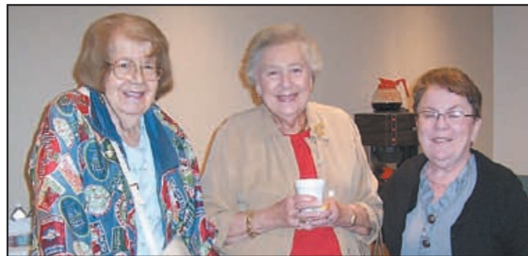
Coffee and cake after first Shaloma meeting of the year.