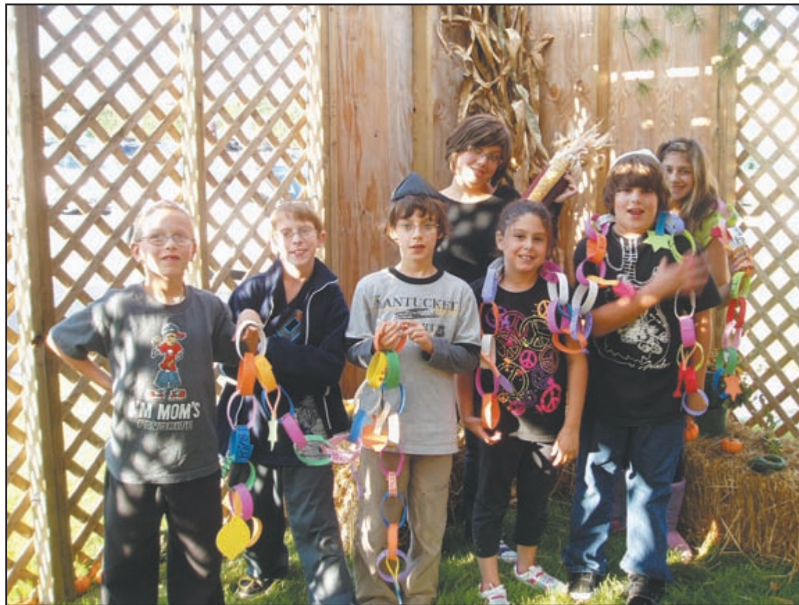
RAISING THE ROOF. Students at the Abram and Rose Weiss Beth El Synagogue Hebrew School gather sukkah decorations that lend a fall atmosphere to the synagogue's Sukkot booth. More photos on Page 9.